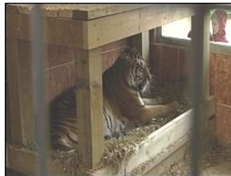
The Great British Circus is the only UK circus to use tigers in its shows

An undercover researcher working for CAPS also discovered the zoo had buried a tiger carcass on its land instead of sending it off for incineration as the law demands.