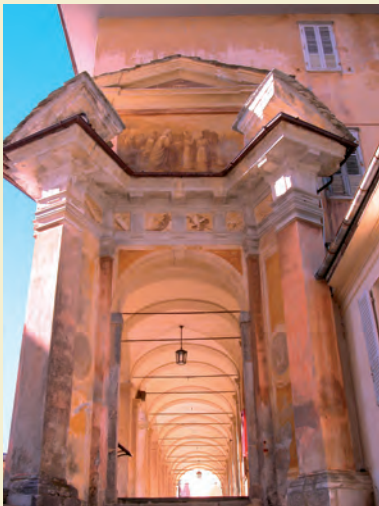
The Golden Gate.