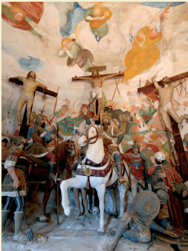
Chapel 38 - Jesus dies on the Cross