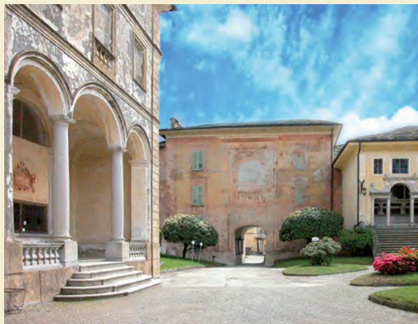
Detail of the Square of the Law Courts