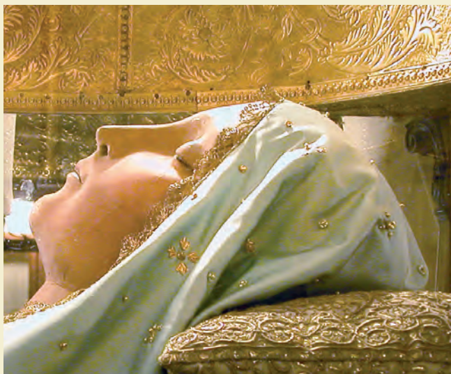
The Scurolo - The sleeping Virgin (detail)