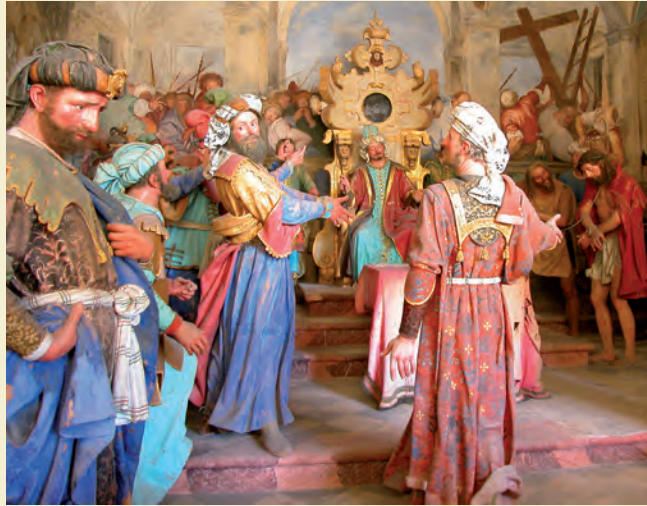
Chapel 35 - Jesus sentenced to death on the cross.